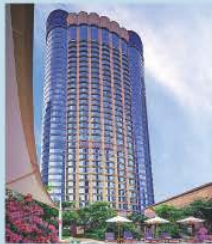
The Westin Kuala Lumpur (Hotel)

IDM is a wholly-owned subsidiary of Ireka Corporation Berhad ("Ireka"), a construction and property development group listed on the Main Board of Bursa Malaysia. Ireka is a major shareholder of Aseana and is the company behind prestigious Malaysian landmarks and developments such as The Westin Kuala Lumpur, Putrajaya Government Administrative offices, ONE Mont' Kiara integrated commercial development, SENI Mont' Kiara resort residences and Technology Park Malaysia among many others.