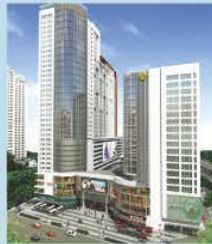
One Mont' Kiara (Commercial)