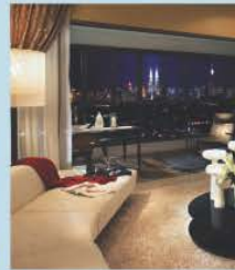
SENI Mont' Kiara Resort Residences (Residential)