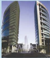
Government Administrative Centre (Government Project)