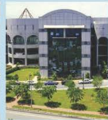
Technology Park Malaysia (Master Project)

Hoa Lam-Shangri-La Healthcare Limited Liability Company is a Joint Venture Company incorporated in Vietnam between Hoa Lam Services Company Limited and Shangri-La Healthcare Investment Pte Ltd Joint Venture Company to undertake the development of the Binh Tan Hi-Tech Health Park which is promoted by the Vietnam Government.